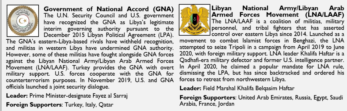
Figure 2. Libya's Warring Coalitions