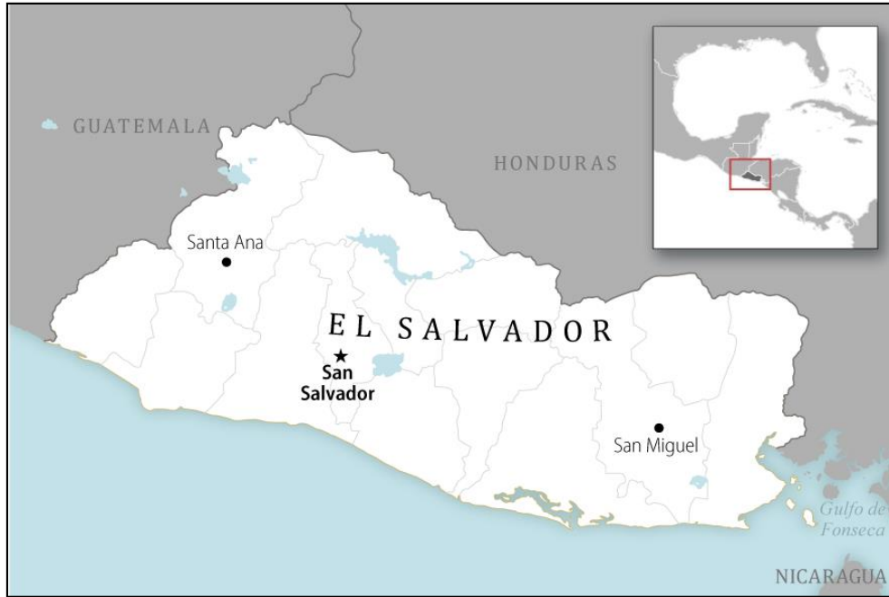
Figure 1. Map of El Salvador and Key Country Data

implement market-friendly economic reforms. ARENA proved to be a reliable U.S. ally but did not effectively address inequality, violence, or corruption. Development indicators generally improved, but natural disasters, including earthquakes in 2001 and periodic hurricanes, hindered progress. Moreover, despite ARENA’s probusiness policies, economic growth averaged 2.4% over the postwar years in which it governed. 7