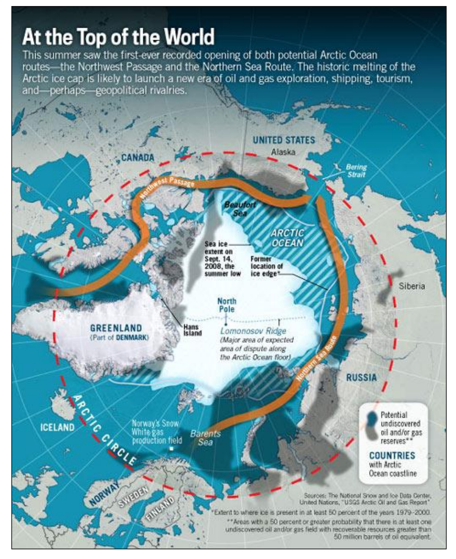
Source: Graphic by Stephen Rountree at U.S. News and World Report, http://www.usnews.com/articles/news/world/2008/10/09/global-warming-triggers-an-international-race-for-the-artic/photos/#1.