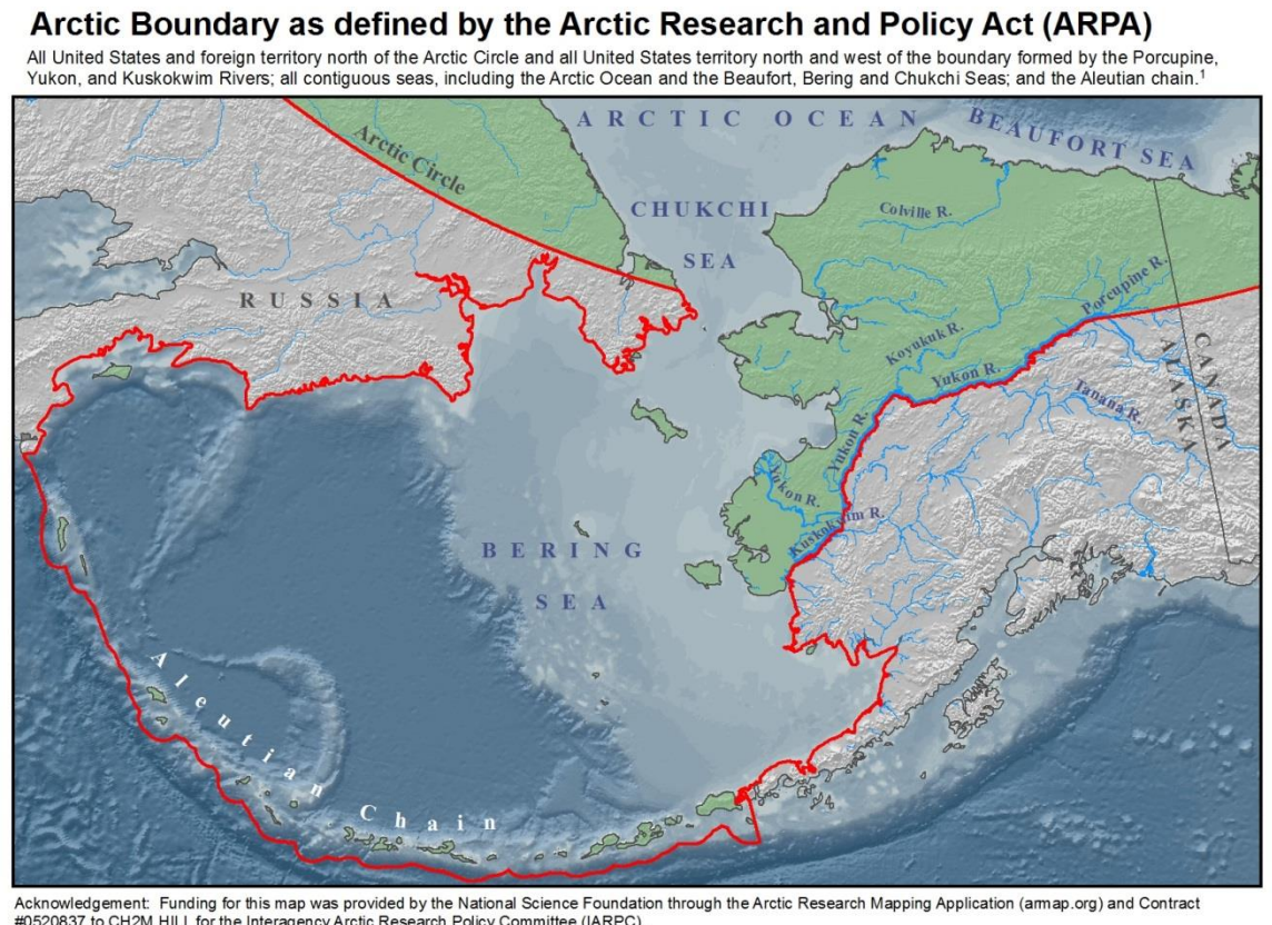
Figure 1. Arctic Area of Alaska as Defined by ARPA

Acknowledgement: Funding for this map was provided by the National Science Foundation through the Arctic Research Mapping Application (armap.org) and Contract #0520837 to CH2M HILL for the Interagency Arctic Research Policy Committee (IARPC). Map author: Allison Gaylord, Nuna Technologies. May 27, 2009.