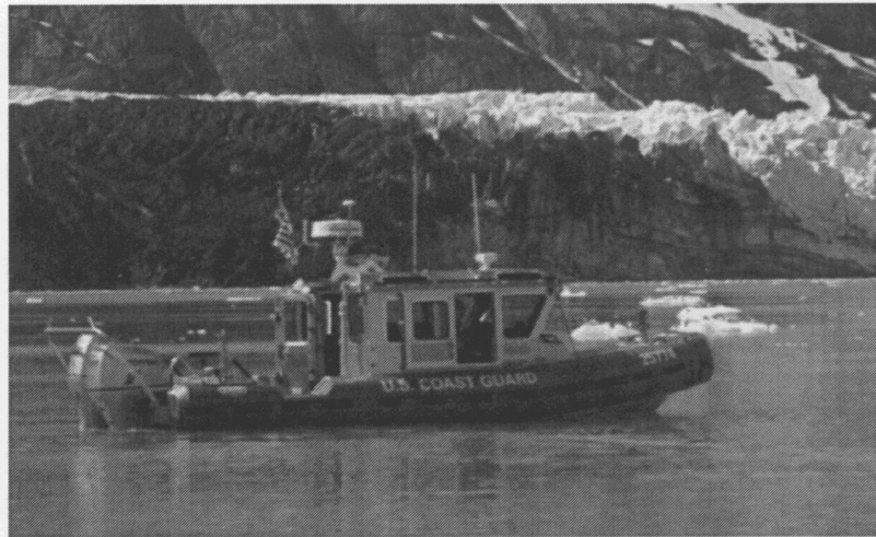
Coast Guard Small Boat at a Forward Operating Location in September 2008

To evaluate activity trends in the Arctic, the Coast Guard commenced extensive Arctic Domain Awareness flights. Coast Guard C-130 Flights originated out of a temporary Forward Operating Location in Kotzebue last summer and will continue later this summer. These flights help develop a complete awareness of all private and governmental activities in the Arctic.