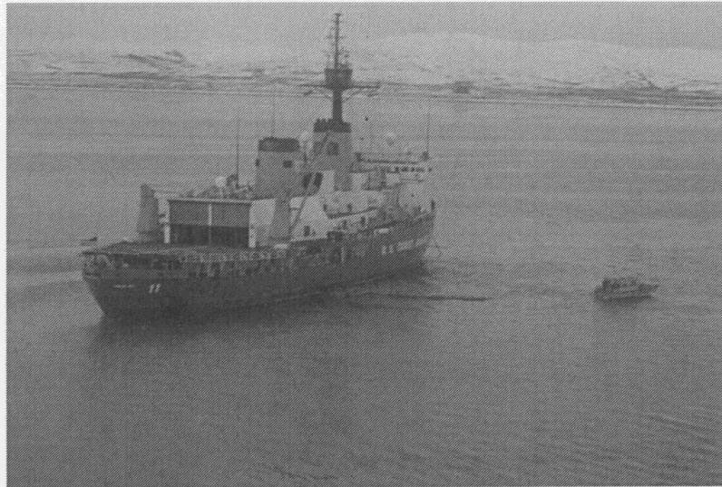
POLAR SEA deploying the Vessel of Opportunity Skimming System (VOSS) in Arctic Waters.

To better understand the impact the northward movement of fish stocks into the Arctic will have on sustainability, a regional management plan is needed. The North Pacific Fisheries Management Council imposed a moratorium on fishing within the U.S. EEZ in the Arctic until assessment of the practicality of sustained commercial fishing in the region is completed. Regardless of the outcome of the assessment and follow-on management plan, it is certain the Coast Guard will play a critical role in its enforcement.