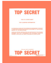
EXHIBIT I-1 CLASSIFICATION LEVELS AND THE ASSOCIATED DEGREE OF DAMAGE

Top Secret – Unauthorized disclosure could cause exceptionally grave damage to national security.