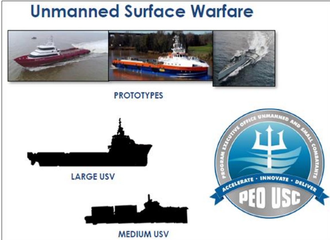
Figure 5. Prototype and Notional LUSVs and MUSVs