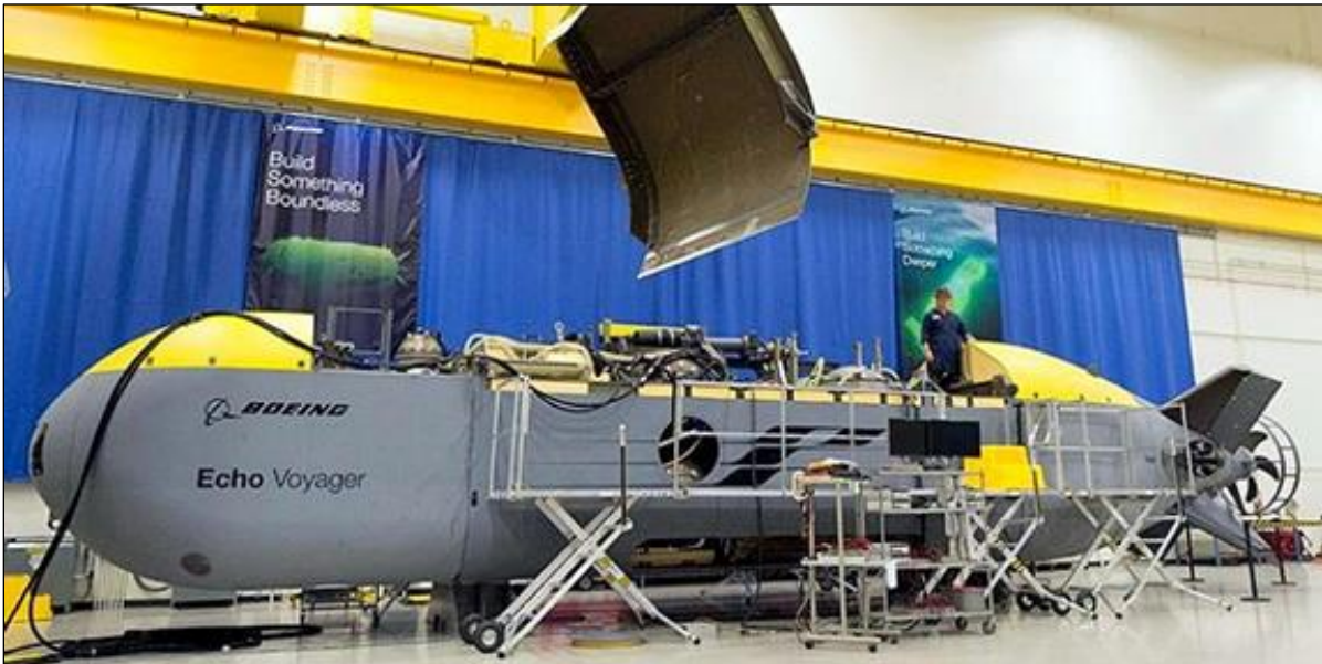
Figure 10. Boeing Echo Voyager UUV