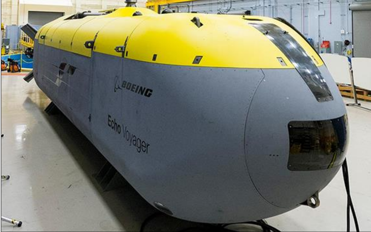
Figure 9. Boeing Echo Voyager UUV