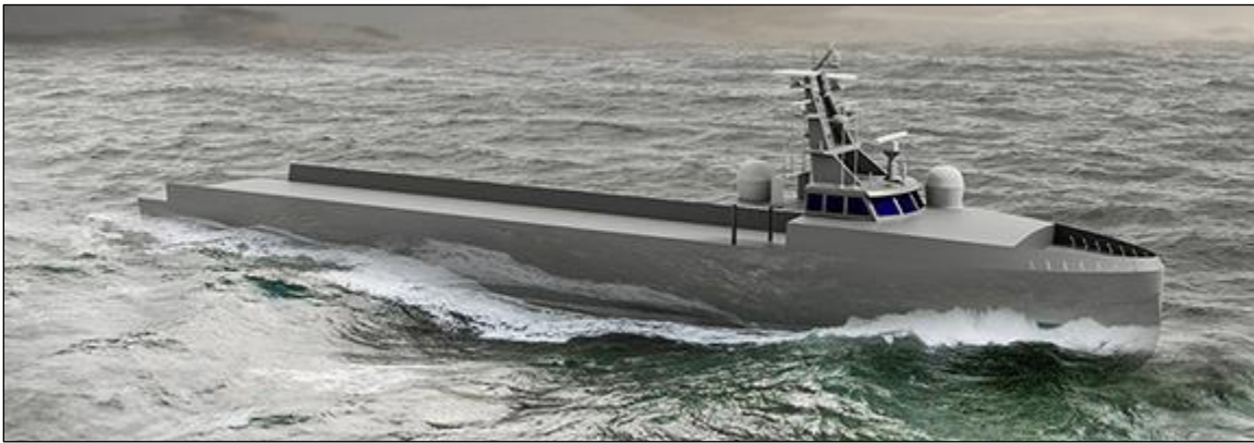
Figure 8. Rendering of L3Harris Design Concept for MUSV