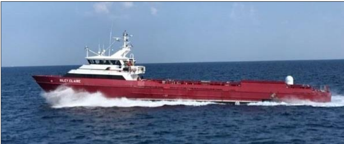
Figure 7. LUSV prototype

Source: Cropped version of photograph accompanying Mallory Shelbourne, “6 Companies Awarded Contracts to Start Work on Large Unmanned Surface Vehicle,” USNI News , September 4, 2020. The caption to the photograph states in part: “A Ghost Fleet Overlord test vessel takes part in a capstone demonstration during the conclusion of Phase I of the program in September.” The photo is credited to the U.S. Navy.