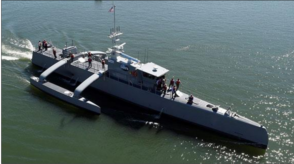
Figure 4. Sea Hunter Prototype Medium Displacement USV