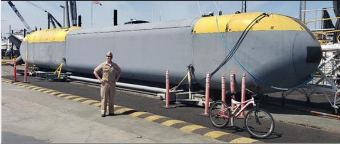
Figure 11. Boeing Echo Voyager UUV