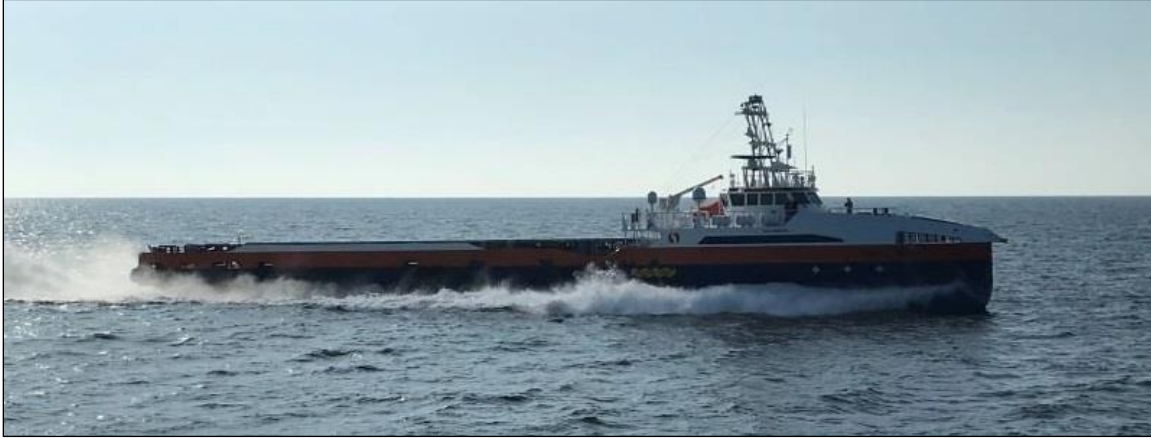
Figure 6. LUSV Prototype