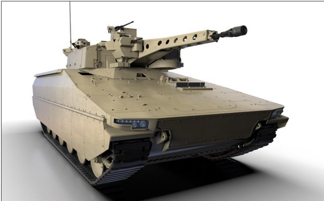
Figure 4. Raytheon/Rheinmetall Lynx Prototype