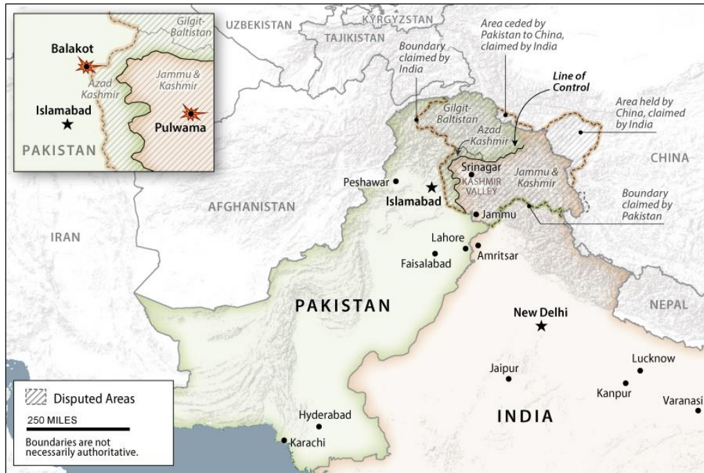
Figure 1. Map of the Kashmir Region

nearly 13 million residents live in the fertile Kashmir Valley, a region slightly larger than Connecticut (7% of the state’s land area is home to 55% of its population). Srinagar, in the Valley, is the state’s summer capital and by far its largest city with some 1.3 million residents. Jammu city, the winter capital, has roughly half that population, and the Jammu district is home to more than 40% of the state’s residents. About a quarter-million people live in remote Ladakh, abutting China. Just under 1% of India’s total population lives in J&K.