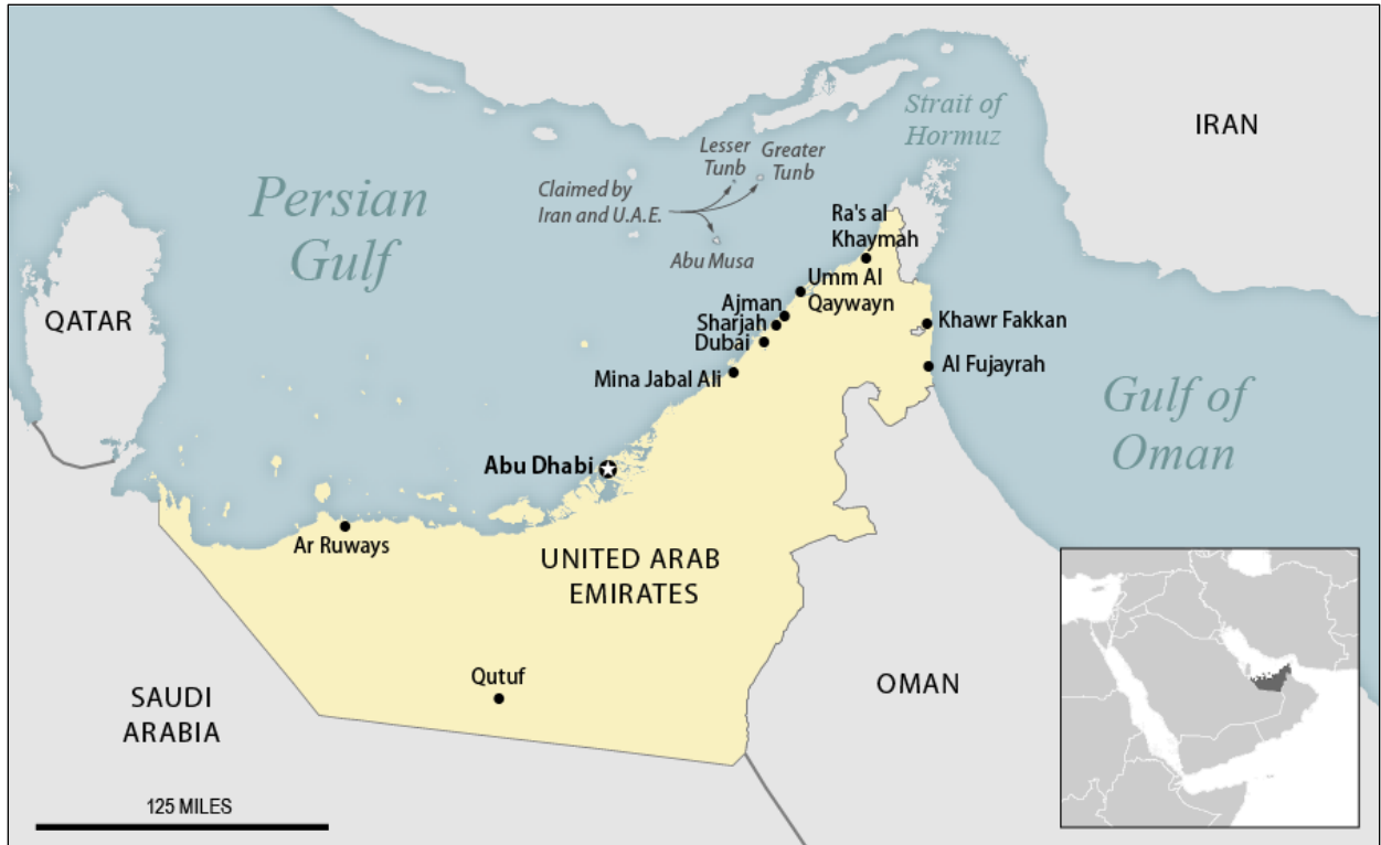
Figure I. UAE at a Glance