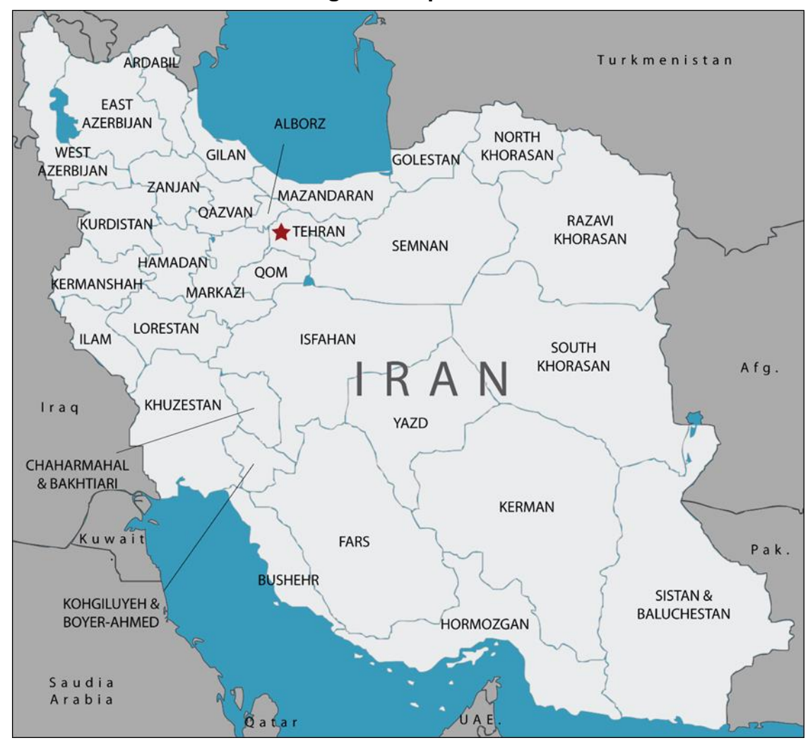
Figure 2. Map of Iran