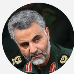
IRGC Major General Qasem Soleimani