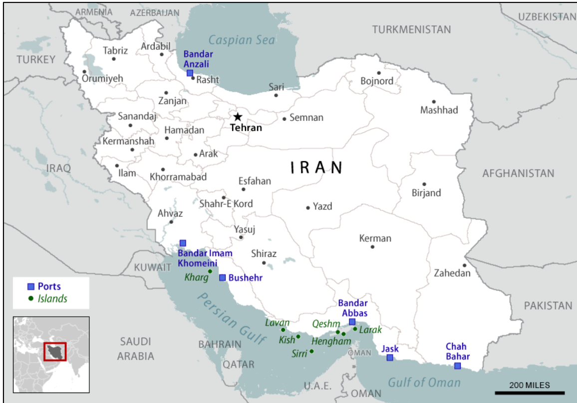
Figure 2. Iran, the Persian Gulf, and the Region

Sources: Created by CRS using data from the U.S. Department of State, ESRI, and GADM.