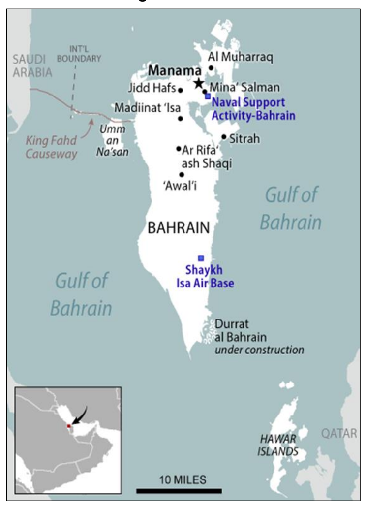
Figure 3. Bahrain