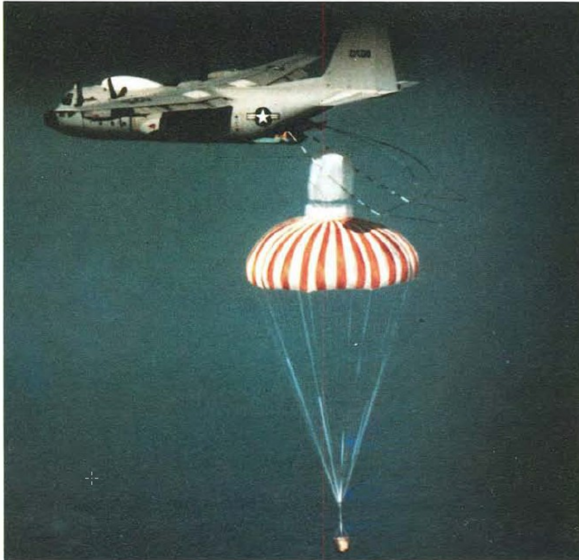
Aerial Recovery By C-130