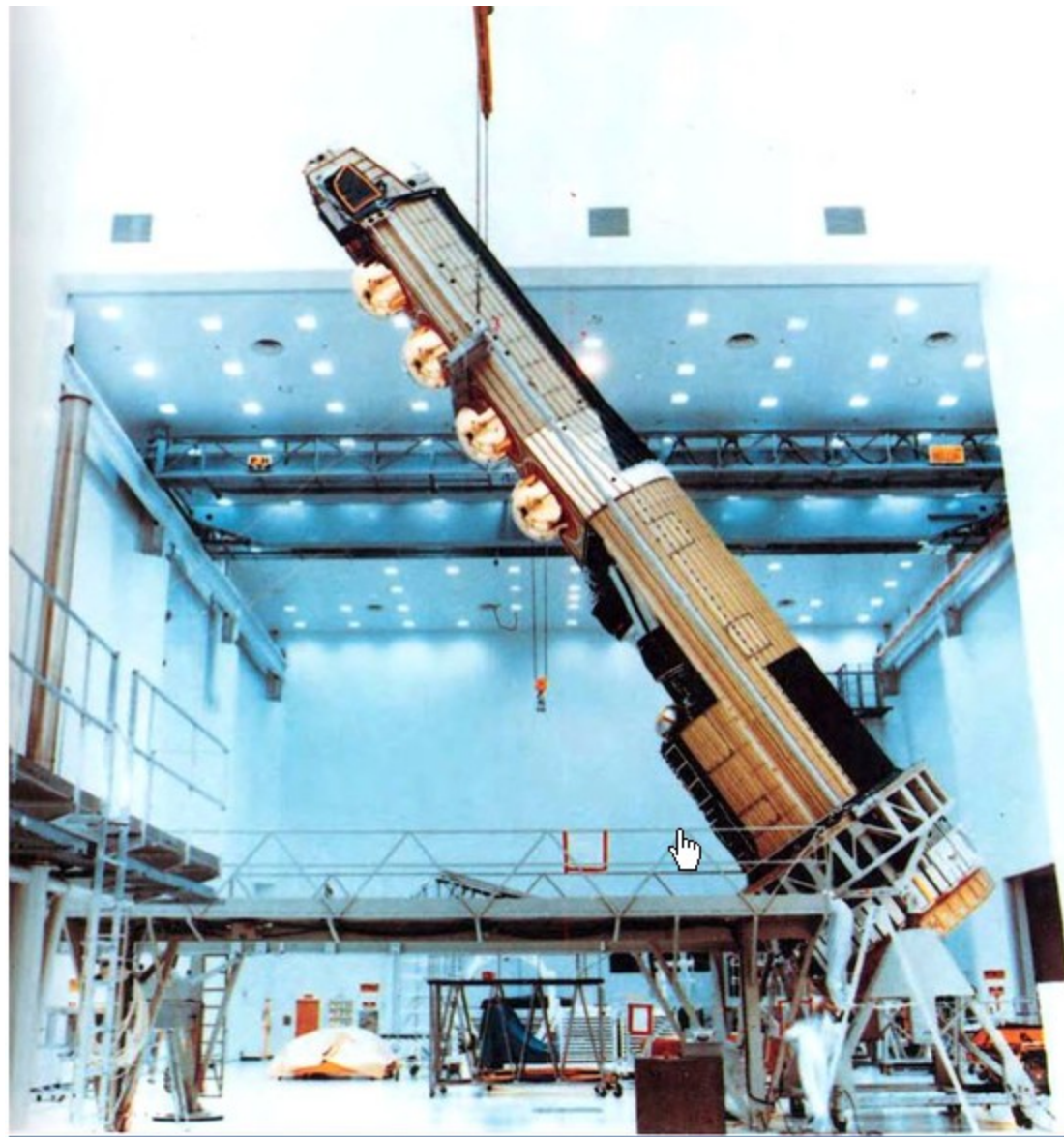
The HEXAGON photographic satellite vehicle. Length 60 ft; diameter 10 ft