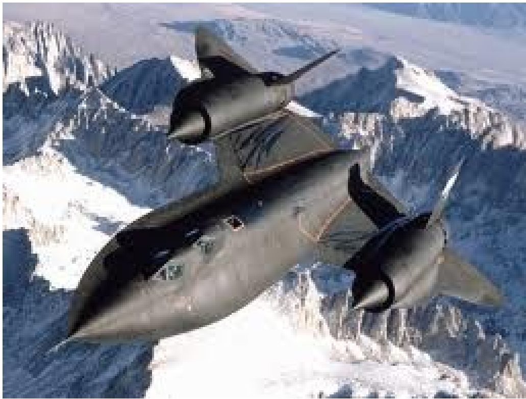
The SR-71 OXCART Mach-3 Recon Aircraft