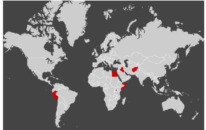
Countries featured in this issue