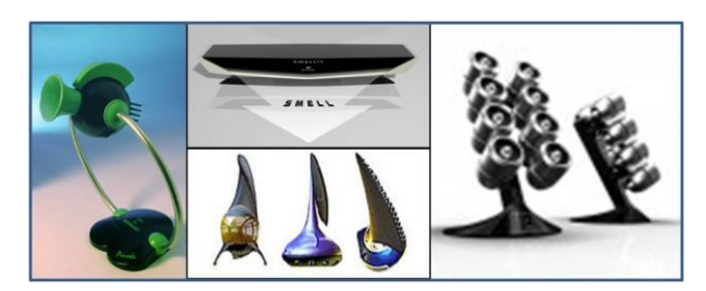
Figure 4. Examples of digital scent systems: Pinoke system (left), Smellit system by Nuno Teixiera (top), Smellit system by Olf-action (right), and iSmell system (bottom).

In addition to attempts to add smell to the projection of movies in cinema theaters, several smell-distributing systems were recently (2000–2005) developed to be used with home computers (e.g., iSmell by DigiScents, Pinoke by AromaJet, Smellit by Olf-action), and are currently being developed by companies like Scentcom (www.scentcom.co.il) and AnthroTronics (www.anthrotronics.com). These systems are frequently referred to as digital scent systems. Some of these systems are shown in figure 4.