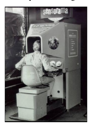
Figure 2. Sensorama: 4-D arcade game (1962).

participant rode a motorcycle through New York while different aromas characteristic of various places in New York were diffused around by surrounding fans (Rheingold, 1992).