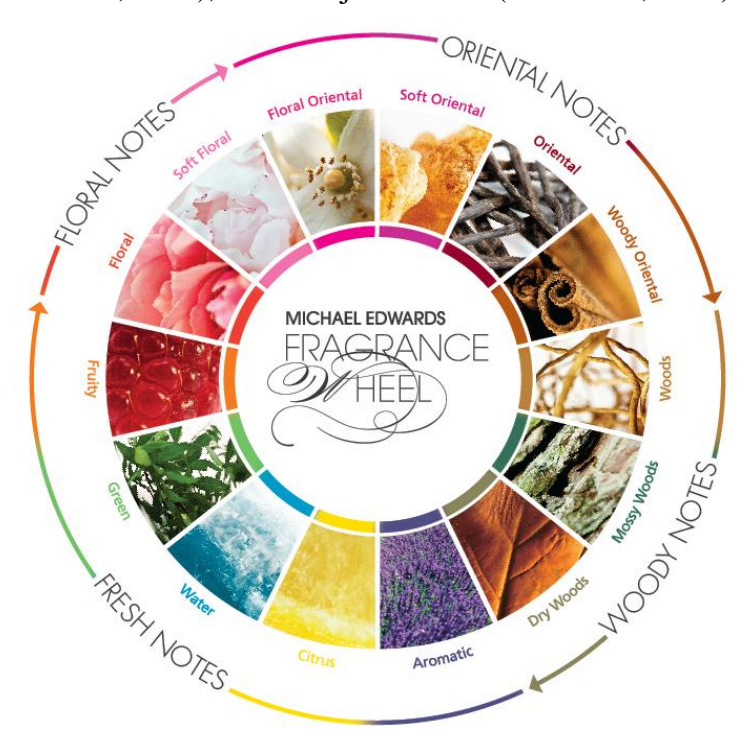
Figure 1. Michael Edwards' perfume fragrance wheel.

Odor classification schemes are often developed for specific applications. The odor wheel concept lays out a variety of odor classes in one ring and lists specific examples of each odor class in another ring. Odor wheels have been constructed for a variety of odor classification applications, such as for wine, coffee, compost, and wastewater (Burlingame et al. 2004, Rosenfeld et al., 2007, Hammond 2010). Probably the most famous odor wheel is The Wine Aroma Wheel developed for California wines by Ann Noble in 1984 (Noble et al., 1984). The wheel has been modified later by many people and in many ways to be used with other kinds of wines (e.g., in Germany for German wines) but is considered by some experts too limited for current wines (Duman, 2011). Other odor wheels include a beer wheel (Meilgaard et al., 1982), whiskey wheel (Piggot and Jardine, 1979), cider and perry wheel (Williams, 1975), brandy wheel (Jolly and Hattingh, 2001), perfume fragrances wheel (Edwards, 2012, figure 1), compost wheel (Suffer and Rosenfeld, 2007), and fruit juice wheel (Muir et al., 1998).