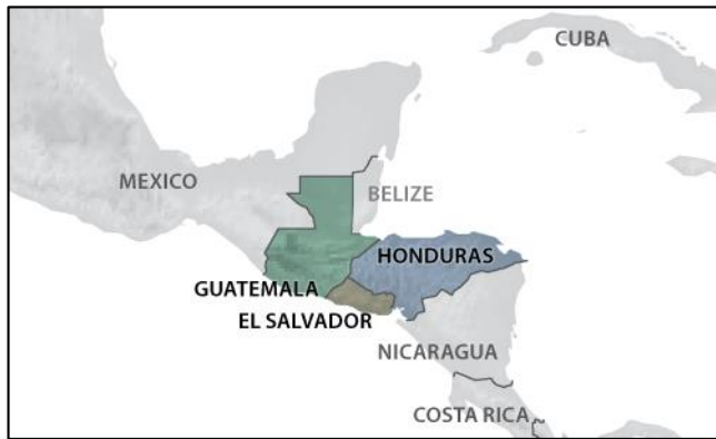
Figure 1. Northern Triangle of Central America

According to a model developed by academics at the University of Texas at Austin, an estimated 311,000 people, on average, left the Northern Triangle region of Central America (see Figure 1 ) annually from FY2014 to FY2020, with the majority bound for the United States. Flows have varied from year to year, however, with an estimated 709,000 people leaving the region in FY2019 followed by an estimated 139,000 people leaving the region in FY2020. Surveys conducted in 2020 found that many potential migrants in the region had postponed their plans in the midst of the Coronavirus Disease 2019 (COVID-19) pandemic but intended to undertake their journeys once governments lifted cross-border travel restrictions.